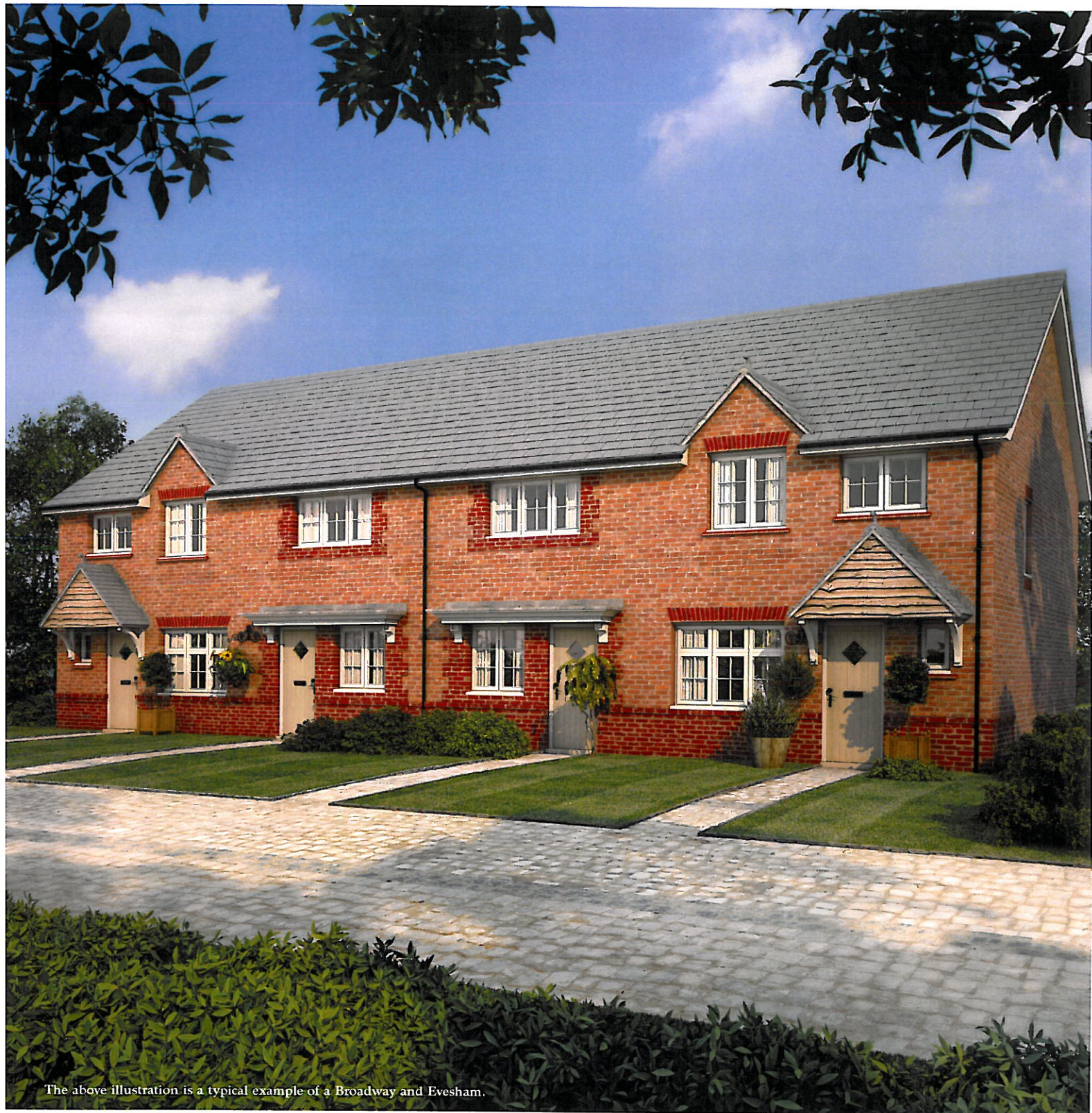
The above illustration is a typical example of a Broadway and Evesham.